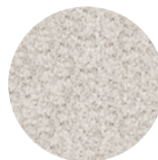
10 WISP RUG Ø CM 600