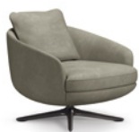
04 RAPHAEL SWIVEL ARMCHAIRS CM 74X86 H78