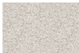
13 WISP RUG CM 600X500