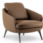
05 RAPHAEL LARGE ARMCHAIR CM 82X90 H78