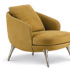
04 RAPHAEL ARMCHAIR CM 74X86 H78