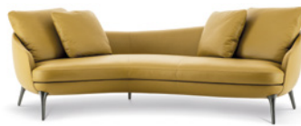
03 RAPHAEL INCLINED SOFA CM 247X135 H88