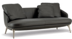
02 RAPHAEL SOFA CM 192X91 H88