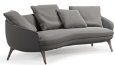
01 RAPHAEL ANGLED SOFA CM 227X118 H88